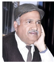
By: Vijay Garg

If the participation of women in the workforce is not commensurate